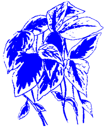
Goutweed, or Bishop's-weed*

Goutweed ( Aegopodium podagraria 'Variegatum') 45 cm tall, spacing 30 cm. Also called Ground Elder. Bright green and white foliage. Sun or shade.