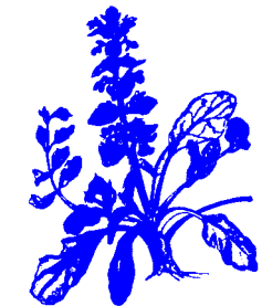
Ajuga, or Bugleweed

Barrenwort ( Epimedium varieties) 30 cm tall, spacing 30 cm. Also known as 'Bishop's Hat' due to its unique flower shape. Fresh green